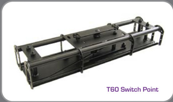
T60 Switch Point

Black epoxy powder coat finish minimizing reflection. Other colours and finishes available on request.